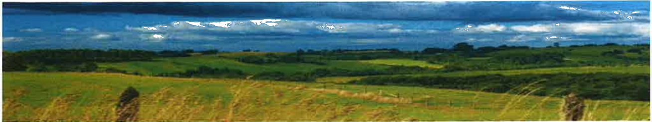
ORCHARD PRAIRIE SCHOOL DISTRICT #123 7626 N ORCHARD PRAIRIE ROAD SPOKANE, WA 99217